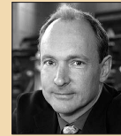
Tim Berners-Lee is the director of the World Wide Web Consortium, a senior researcher at the Massachusetts Institute of Technology's Computer Science and Artificial Intelligence Laboratory, and a professor of computer science in the Department of Electronics and Computer Science at Southampton University. Contact him at timbl@w3.org .